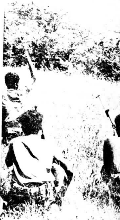
Fighters of the P

Our struggling masses: What is taking place in the Arab Gulf today is nothing new. It is the continuation of the aggressive plans of Anglo-American imperialism pursued since the discovery of oil in the 1930's. The present stage is the establishment of the