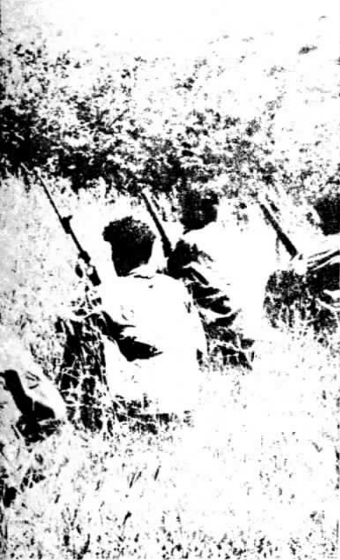
s Liberation Army

the exploiting bourgeoisie, to take the place of the military force of imperialism after the withdrawal by Britain that the imperialist 'Labour' Party has declared will take place by 1971.