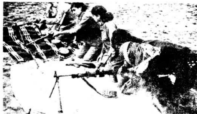
Palestinian women fight beside the men in the war of liberation of Palestine. Photo shows women guerrillas training at Al-Fateh centre.

This withdrawal comes as a result of the ARMED STRUGGLE WAGED BY THE POPULAR FRONT FOR THE LIBERATION OF THE ARAB GULF that rejects all these facades, and fights them to the end. By doing so, the Front brings the masses and their revolutionary leadership to their historical task, the explanation of the nature of the 'Union', to avoid any illusions about it, since it is just an imperialist plot designed to divert the masses from