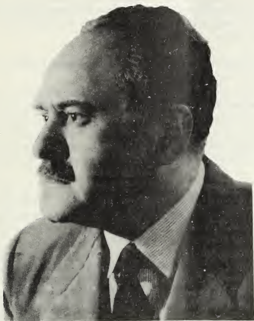
Dr. Moshe Sneh Member of the Politbureau, Secretary of the Communist Party of Israel