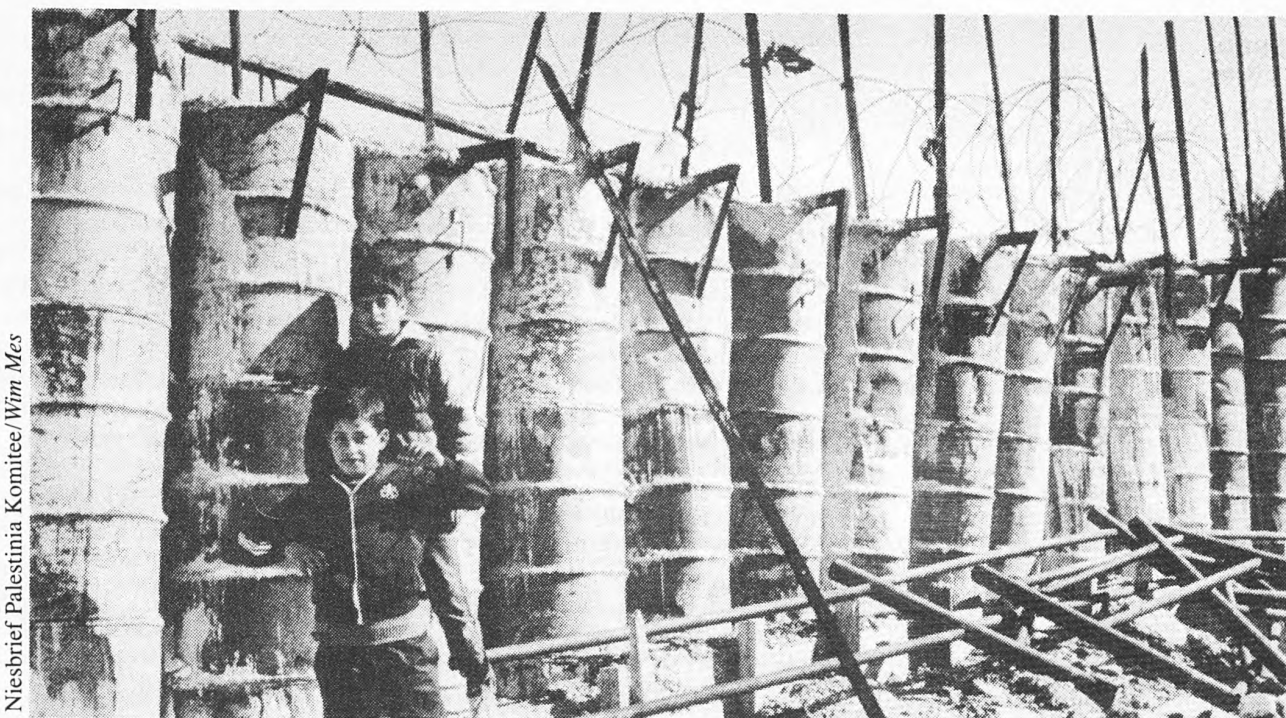
Palestinian boys at a barricaded entrance to Kalandia camp on the West Bank

Israeli spies raid the U.S. arsenal with only measured responses. Jewish terrorists openly kill and threaten Pales-