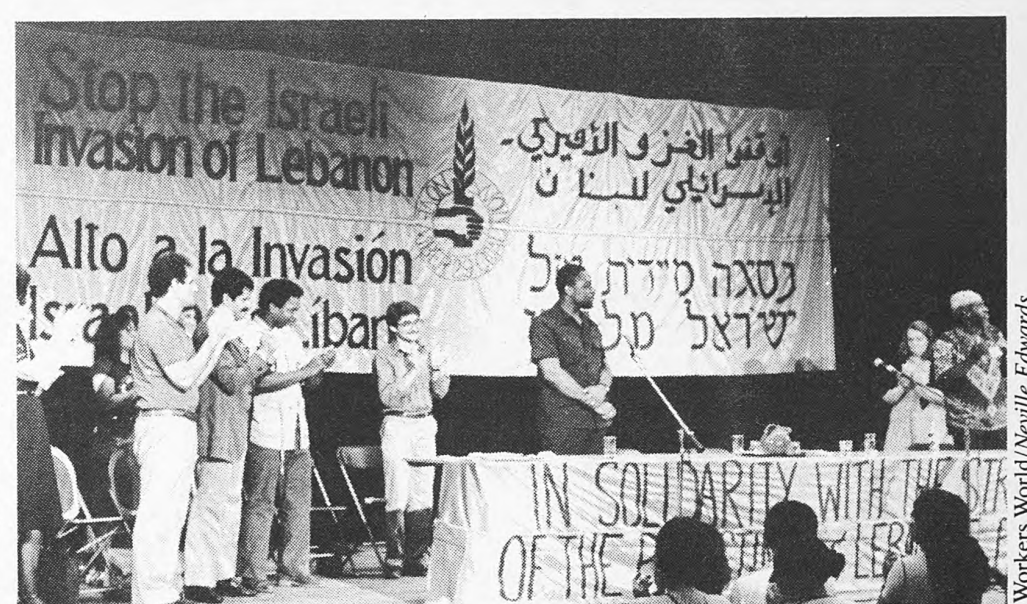
The U.S. peace movement was not silent during Israel's 1982 invasion of Lebanon. Coldwell Taylor, United Nations Ambassador from Grenada, addresses a July 25, 1982 teach-in in New York. A year later Grenada became yet another victim of Reagan's militarist policies.

he May 17 agreement was opposed by the newly formed Lebanese National Salvation Front (NSF) which grouped a sizeable portion of the political spectrum in opposition to the Gemayel regime. This alliance benefited from Syrian political backing because Damascus saw the agreement as the consecration of an Israeli miliary and political hegemony over Lebanon