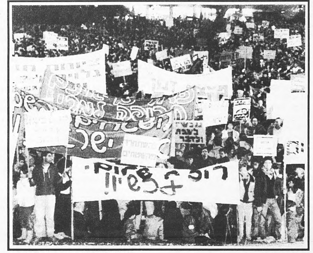
Israelis demonstrating in Tel Aviv for peace.