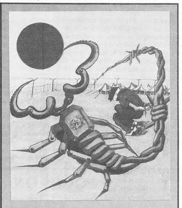
Palestinian prisoner's painting smuggled out of Ketziot prison, also known as Ansar 3, in the Negev desert. More than three thousand prisoners suffer from scorpions, poisonous snakes, brutal Israeli guards, and temperatures exceeding 110 degrees F. Human-rights organizations demand that the illegal prison camp be shut down. Send letters protesting U.S. funding of such detention centers to the State Department, Washington, DC 20520.

may be divisions within the PLO, but one thing that they are not divided about is the uprising, and there's total unity around them. There are other problems, but in terms of what is happening now, in terms of the popular schools, the medical things that are happening, the agricultural collectives, the movement towards self-sufficiency, there's total unity.