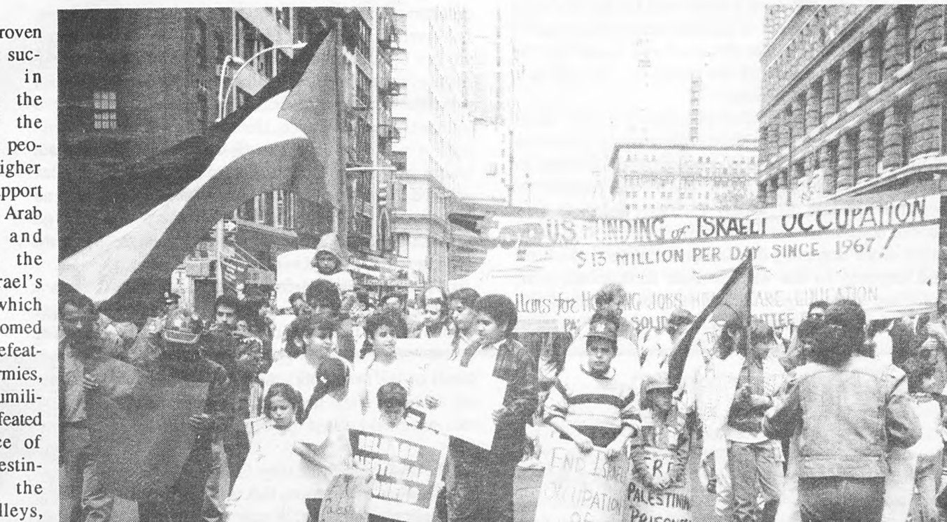
Children lead national march in New York to protest Israeli occupation, June 4, 1988.

year, has proven to be very successful advancing the rights of the Palestinian people to a higher level of support both in the Arab region and througout the world. Israel's military, which was accustomed to easily defeating Arab armies, has been humiliated and defeated in the face of young Palestinians in the streets, alleys, and country roads of the West Bank and Gaza.