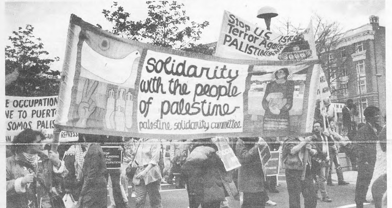
Demonstration for Palestinian rights in Washington, D.C. last March.