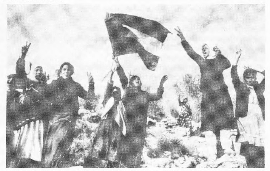
Women at Beita, West Bank, demonstrate for an independent state.