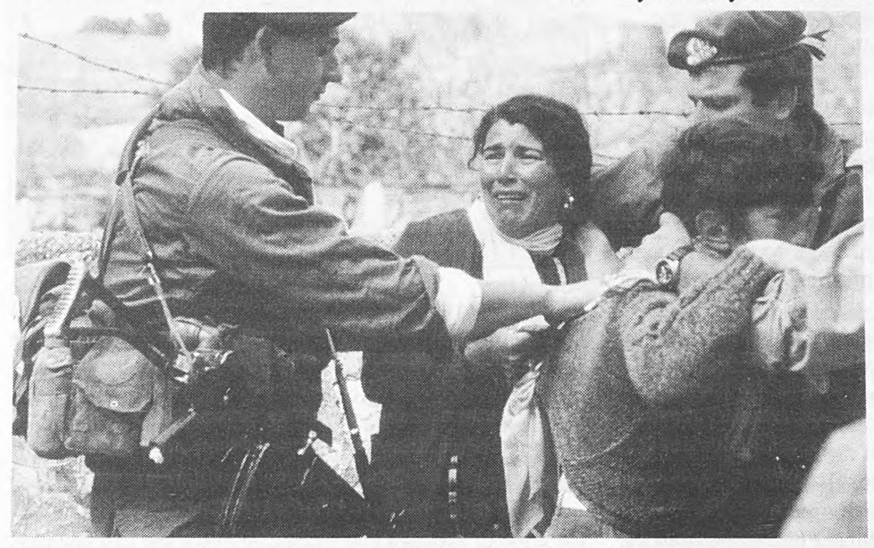
Palestinian woman tries to rescue a boy from Israeli soldiers in Ramallah.

Strange also is the new Palestinian diction that insists on redefining reality in terms that bear no relationship to earlier distorted forms. "Autonomy" for instance has been unanimously rejected both as a Camp David gift or in the guise of the Shultz initiative; yet the uprising proceeds to transform itself into a grassroots democratic, popular infrastructure which asserts its own "autonomy" in spite of the occupation. As the popular committees (now declared illegal) emerge from each neighborhood, village, and camp, a new structure and "quality" of life materialize to replace those which had been artificially and externally imposed by the occupation. Yet the Israelis and their American patrons insist that by improving the "quality" of life under occupation they will be able to impose law and order on "the inhabitants of the territories." But the Palestinian sense of "quality" as expressed effectively in their own transformation of social realities and priorities is entirely antithetical. We are willing to do with less, not more; we practice selfhelp and collective responsibility rather than seek handouts and artificial dependence. We close shops more than we keep them open; we grow our own vegetables, teach our own children, guard our own streets, find our own blood groups, treat our own sick, and share our own resources and supplies. Unequivocally, in our dictionary there is no "qual-