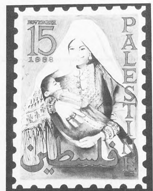
Painting by Judy Hirsch for "In Celebration of the State of Palestine" art exhibit. (see "Letters to Editors").

Public support for peace talks remains strong. The many shifts toward peace among Israelis are very significant [see article, page 1]. In recent polls, 70 percent of Americans support the U.S.-PLO dialogue; 58 percent of American Jews say Israel should talk to the PLO, too. In response to this new atmosphere, the U.S. State Department issued its first-ever report to seriously address Israeli violations of Palestinian human rights in the course of the 22year-old occupation of the West Bank and