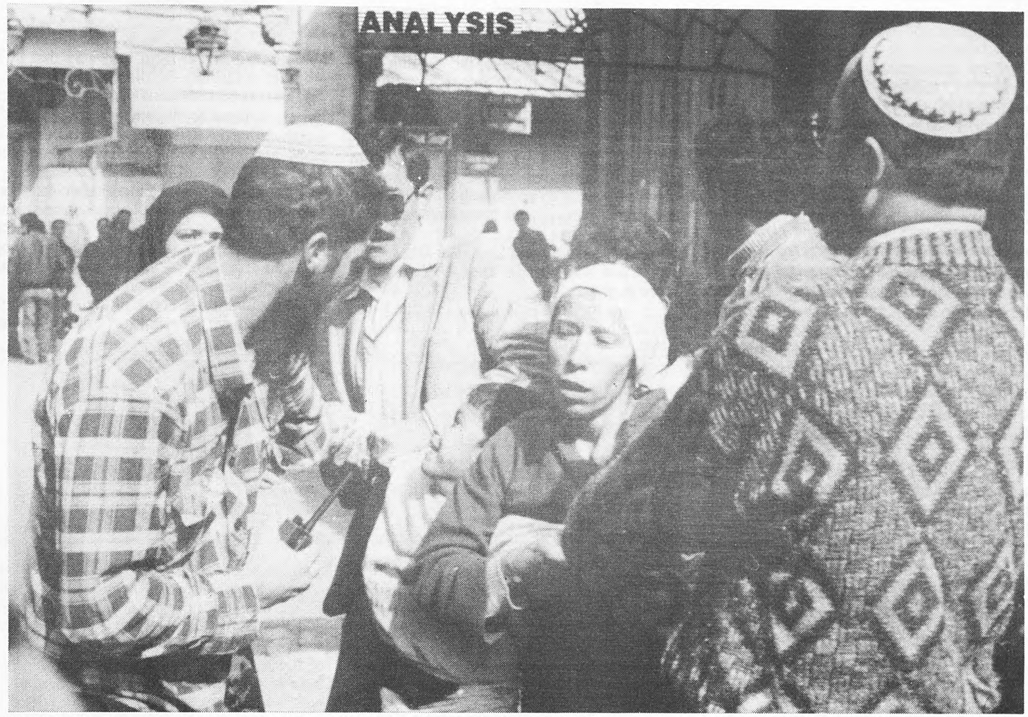
Jewish settlers attempt to abduct a Palestinian child while his mother fights to set him free.