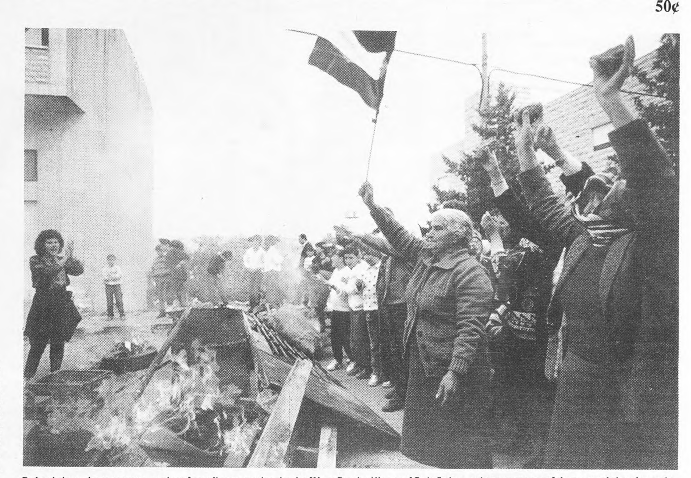
Palestinians demonstrate against Israeli occupation in the West Bank village of Beit Sahur, where a successful tax revolt has brought massive repression.

our elected representatives s of the American people. □