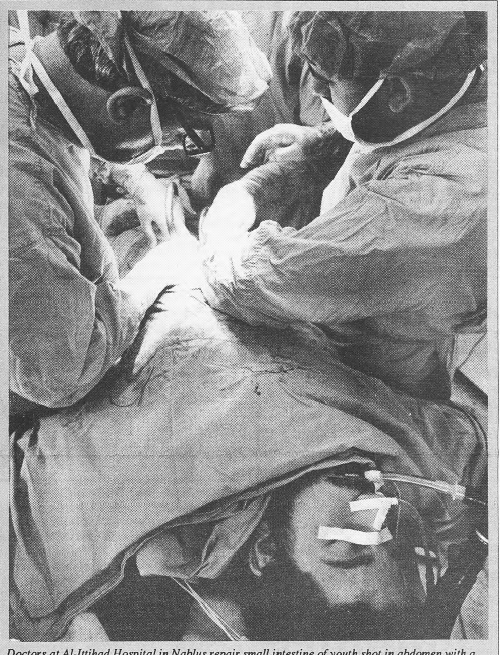
Doctors at Al-Ittihad Hospital in Nablus repair small intestine of youth shot in abdomen with a