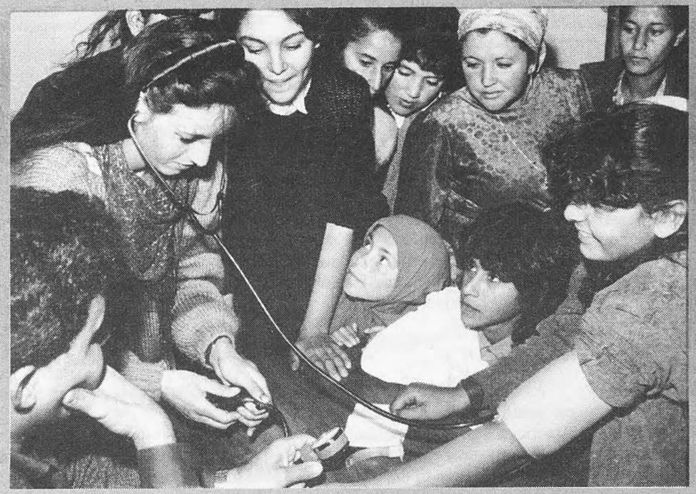
Palestinian doctor teaches first aid class to girls in El-Khadi Village.

EK: Yes. But you can never count how many because women are sometimes jailed during demonstrations, and after three days they are released. More than one