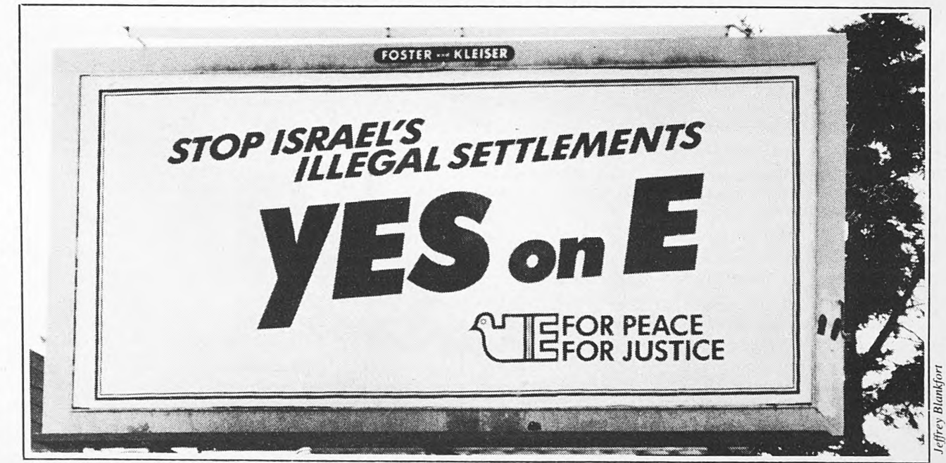
Taxpayers for Peace in the Middle East (TAPME) campaign billboard in Berkeley