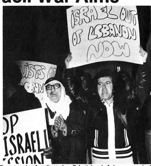
Protest against Israeli attack onPalestinians in Lebanon organized by PSC March 17 outside NYC Israeli Mission.