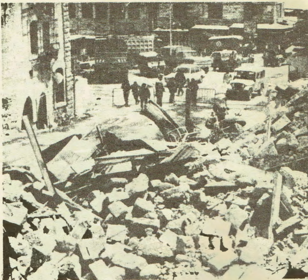
Houses destroyed by the occupation forces following the May 2nd operation

"The imperialist, Zionist and Sadat alliance safeguards not only the imperialist inte-