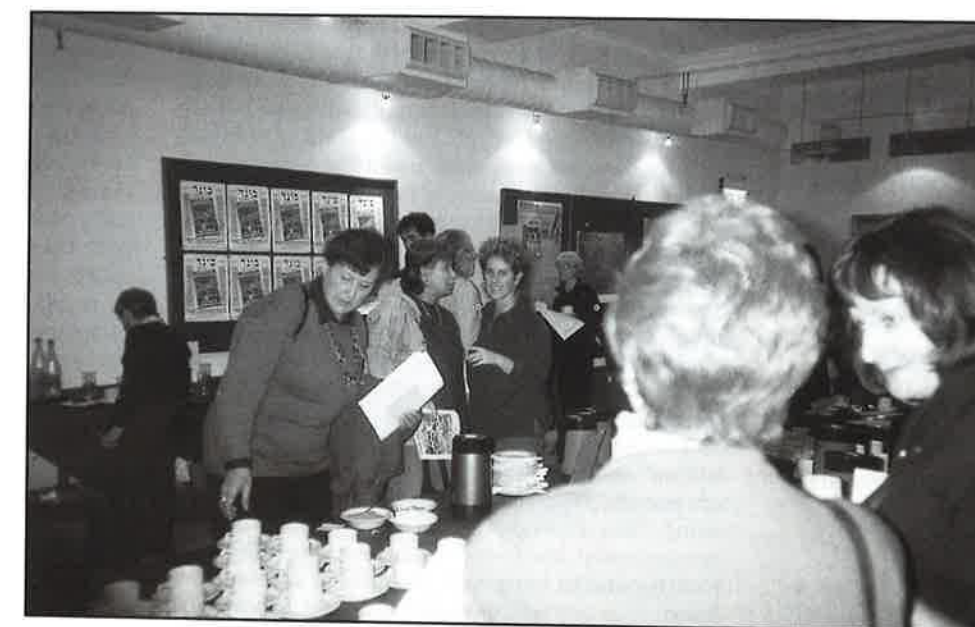
Discussing socialism over coffee