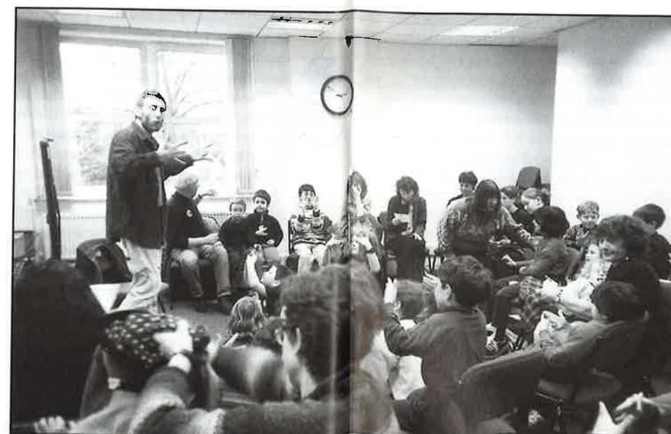
Poet Michael Rosen animates his audience